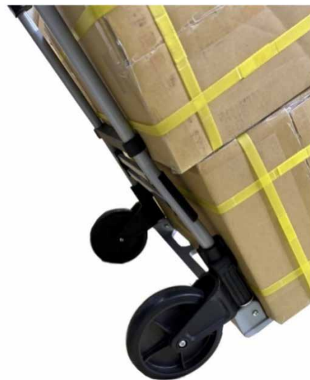
Loading and moving